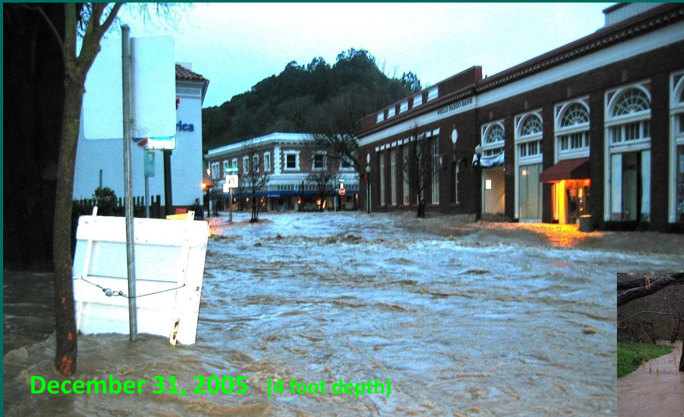
December 31, 2005 (4 foot depth)

❖ Historical Flooding: 1925, 1943, 1982 & 2005