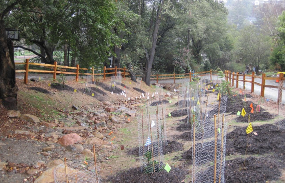
MIDDLE REACH LOOKING DOWNSTREAM