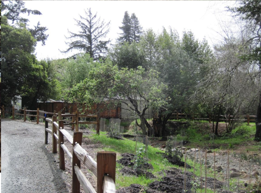
ELM AVE. UPSTREAM