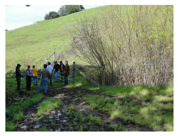
Cheda Ranch before and after 319 MMWD project