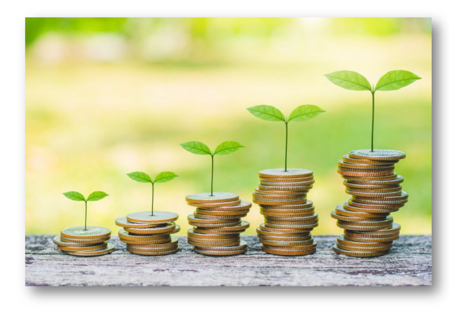
But, it needs to be a team's FUNDED focus & role in order to make it happen!

Collaboration is a means to pool & share resources, distribute burdens, develop and deploy consistent messaging, implement economy-of-scale actions, and enhance magnitude of desired outcomes.