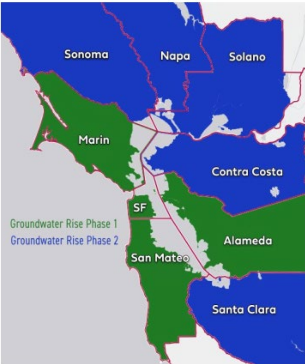
Figure 1: The two phases of the project, when combined, will generate a region-wide set of geospatial resources.